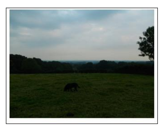
View of Ifold looking East from hill leading to Plaistow Place

vision of a heavily wooded area and few if any houses are visible.