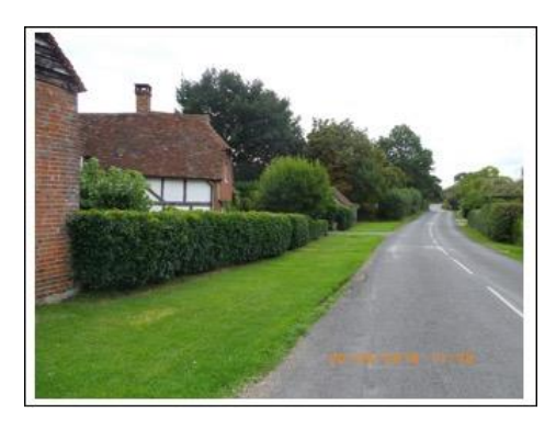
The Street view south

Ribbon development running from the south to the core of the village has allowed fields to remain behind running to the centre of the village, creating a further open character and sense of the countryside running into the village.