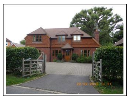
Clements Cottage, Rickmans Lane (c.2000)

To the west Nell Ball housing estate is typical 1950' and 60's local authority housing providing good, simple design of brick and pitched concrete interlocking roof tiles but rather out of character to the older village vernacular. Oakfield, a speculative build in 1970's similarly does not reflect the characteristics of the village, but is predominantly brick, with plain concrete tile but has no design features to relate it to the core of the village. Ashfield_makes a greater attempt at a more interesting design but again fails to reflect the older vernacular or to use plain tiles to the roof structures.