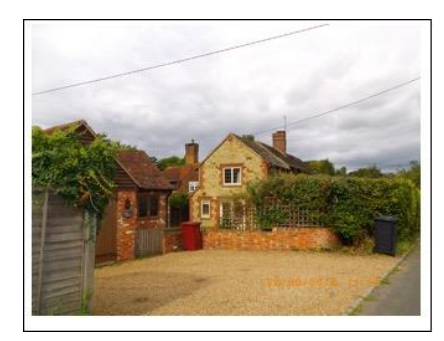
Stone House, The Street