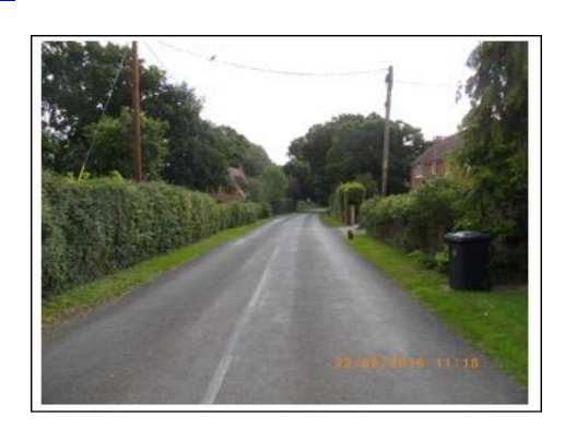
Rickmans Lane view East.

Large open green spaces and wide verges in the village and its immediate surroundings has created a spacious feel and emphases the rural quality of the village. Much is tree'd, particularly around The Green with mature specimens reducing views through and across the village. The Conservation Area Character Appraisal and Management Proposals (May 2013) identifies the important views into and out of the Conservation Area.