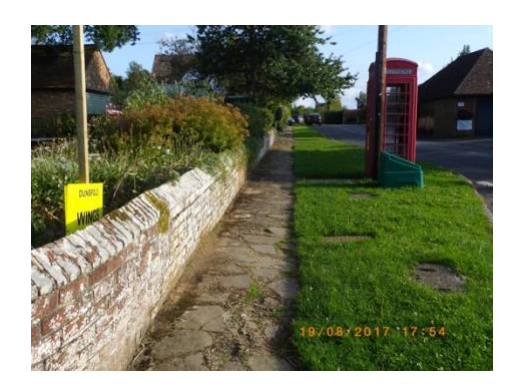
The Sun Inn

Verges and Roads: In the central core of the village roads are partly urban in style with road and pavement running from Nell Ball to the shop but this changes southward to The Street where there is a short section of stone pave path and grass verge.