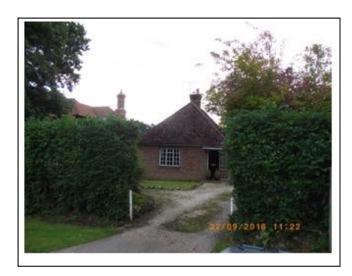
Rickmans Lane bungalow c.1950

Moving away from the historic conservation centre toward Rickmans Lane the style of houses are principally modern 20th century and an eclectic mix of individual designs. Primarily constructed of brick with plain concrete tile pitched roofs. Bushfield was constructed in the early 1970's and is of chalet style with steeply pitched roofs 52degree, rather discordant with the surroundings. The later additions are more sympathetically designed to marry with the historic dwellings. Most recently the old Mission hall was redeveloped with a very modern style prominently positioned on the side of the road at the bend Rickmans Lane runs the Street. Although modern in style, it does use traditional materials. Plot sizes are good and density levels are low as is the plot to building ratio.