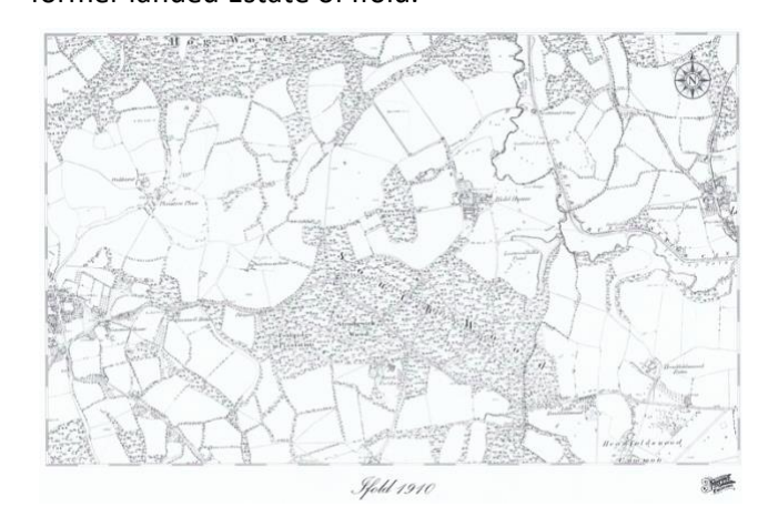
Map of Ifold 1910

Historic Background: The settlement is modern and dates from the mid 1930's. It is unusual in its formation and with Durfold Wood, is unique in the Chichester District area. It is situated on the former landed Estate of Ifold.