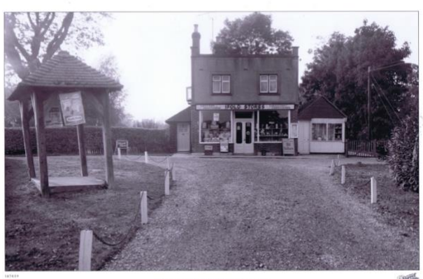
IFOLD, THE STORES C1955

A further residence at the east entrance to the settlement became the village stores and another plot became a repair garage. There was no provision made for public open spaces. Village events were held for many years on the larger acreage plots, with kind permission of the land owners, but these have now all been redeveloped for housing. A vehicle repair garage remains and the Ifold shop has recently re-opened in part of the old shop, selling limited supplies.