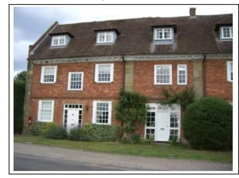
Shillinglee farm buildings conversion

The settlement lies in the countryside and there is no settlement boundary. Chichester Local Plan: Key Policies 2014-2029 Policy 45 applies. Accordingly, development is restricted to those existing dwellings either for replacement dwellings, i.e. one for one or with extension of the existing building. Many of the buildings, which make up the nucleus of the hamlet are Grade II listed (see map) and this confers further restrictions on development.