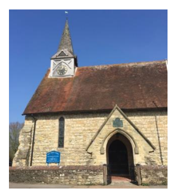
Holy Trinity Church, Plaistow

Some of the land and property in the area was owned by the manor of Slindon, a manor of the Archbishop of Canterbury. Parts of the Parish were part of the Earl of Egremont, Earl of Winterton and Ormaston Family Estates, which now forms the Leconfield Estate. This association is apparent in the architecture of Shillinglee and some of the outlying dwellings and buildings and the provision of the Church and Village Hall in Plaistow.