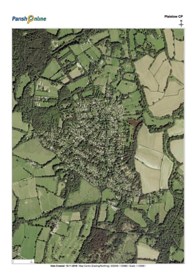
Aerial photograph of Ifold

Geographical Background: The settlement is located to the east of the Parish on its boundary with Loxwood. It is set in lower lying ground than Plaistow village. The settlement was formed in an area of predominantly oak woodland on heavy weald clay soil running through to the water meadows beside the River Lox. Large tracts of woodland have been lost to previous development, but some remain and are designated as ancient woodland. Essentially, Ifold