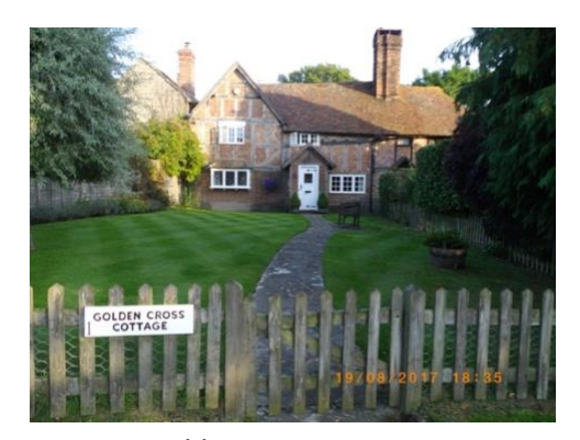
Golden Cross Cottage

behind it (such as at Golden Cross Cottage) is more in keeping with the character of the village.