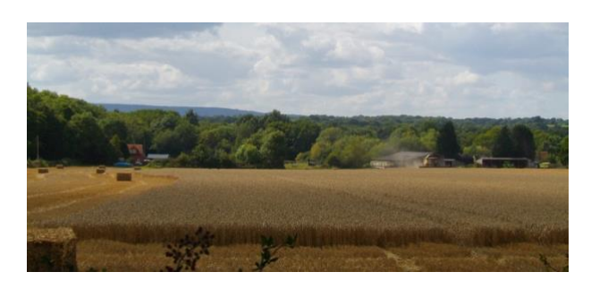
Looking west from the B2133

Views into the settlement are generally from higher ground; looking west from the B2133 junction with Plaistow Road and from public footpaths to Plaistow Place looking east.