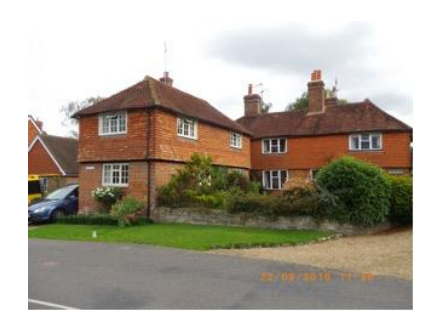
Brackenhurst and Elmleigh

Design and Buildings and Materials: While there is no established style in Plaistow, there is a high level of homes built of brick with tile hung elevations and combined with a maximum height in the region of 8 metres gives a strong sense of cohesion for domestic dwellings which have embodied domestic use over many centuries.