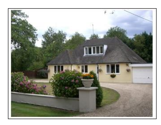
Typical Durfold Wood bungalow