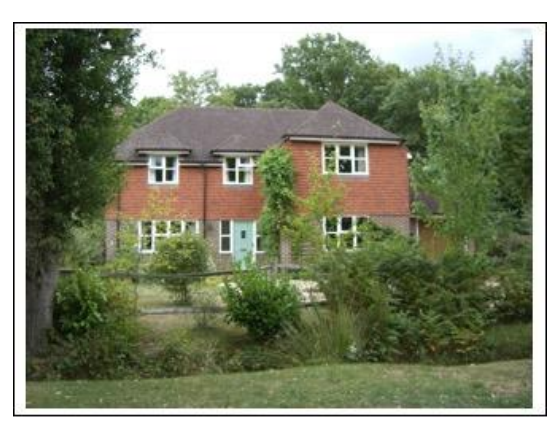
Typical Durfold Wood house

Design of Buildings and Materials: Within the Durfold Wood Settlement there is no established style, it is an eclectic mix of modern 20th century dwellings, very similar to Ifold.