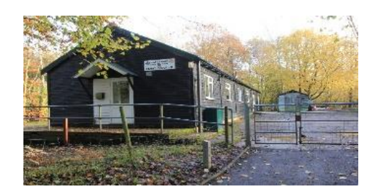
Ifold Scout/Girl Guide HQ

In Plaistow there is a Church (a Chapel of Ease), Primary School, Public House, local shop with café (Plaistow Village Stores), a village hall with youth club annex and a pre-school with a dedicated outdoor playground; weekly post office services are dispensed in the Youth Club; a multi-use outdoor games area (floodlit); a village green; a recreation ground with a pavilion and an outdoor children's playground; and a football ground (Foxfields) with pavilion.