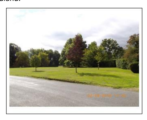
Village Green view West

The character of the village edge is predominantly soft and is formed by gardens, bounded by hedges or hedges and trees. This edge is irregular and indented, lacking long straight lines and running into farmland and areas of woodland and Ancient Woodland.