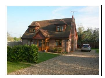
Mix of modern 20th century dwellings