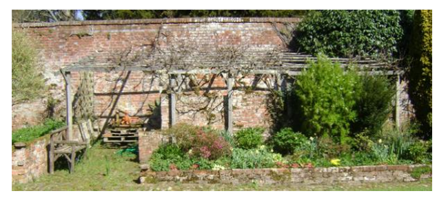
The Olde Garden

Historic Buildings and Structures: There are a number of original buildings within the settlement, identified at Appendix 3 in Neighbourhood Plan. One is Grade II Listed and together with other buildings and structures of local interest, including The Olde Garden (a former potting shed of Ifold House), the historic Estate garden walls and garden footpaths and the lake are key links to the origin of the settlement.