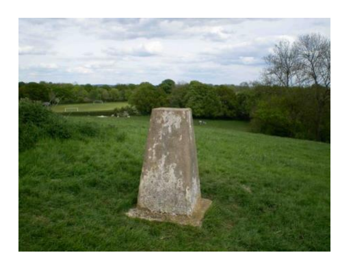
Trigonometry (OS) point

western side of Plaistow Village, called Nell Ball, dominates the landscape of the village. A trigonometry (OS) point is situated near the top and it has been used, even recently, as a Beacon Site for special occasions. The ground also rises to the north of the village to Plaistow Place.