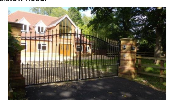
Inappropriate gate posts and driveway gates

There has been a growth in the use of close boarded 1.8 metre fencing in a number of areas, primarily where these relate to private garden space where plots run parallel to the road. But there has also been similar usage on the main Plaistow Road.