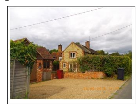
Stone House, The Street

The architectural details, as described at 4.5 above, are typical of West Sussex rural vernacular. It would be difficult to identify any particular one that possessed unique or novel features but they embody changing domestic use dating back several hundred years. The buildings exhibit many attractive features including blind gables, open eaves, hipped and half–hipped roofs and original (or near original) fenestration. Black weather-boarded Barns, with half hipped roofs are also a common feature. Collectively the core buildings form a strong anthology of vernacular rural buildings.