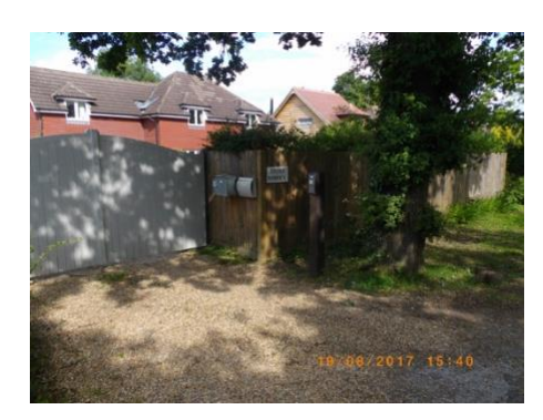
Inappropriate gate posts and driveway gates